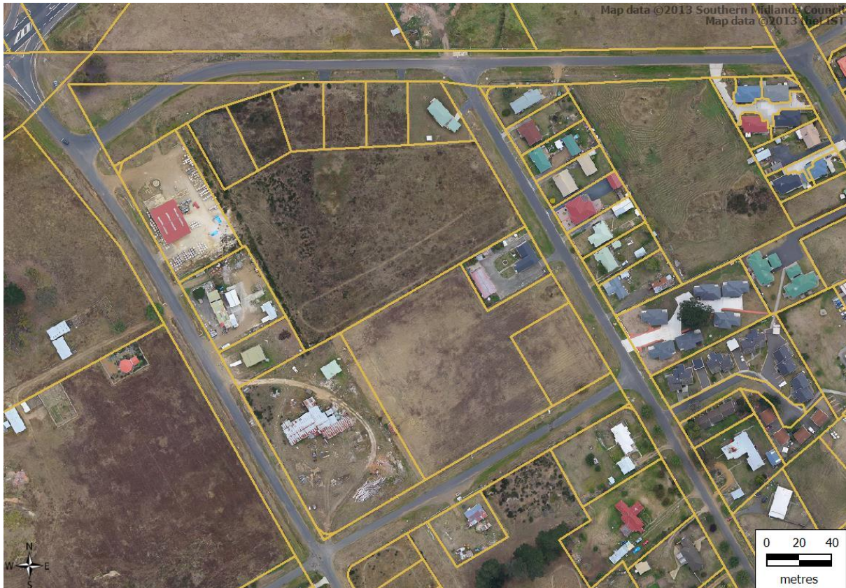
Image 1 – Aerial Photo taken in January 2011 clearly shows the lot subject to the Amendment and Development Application and the adjoining properties

No representations or comments were received in relation to the draft planning scheme amendment.