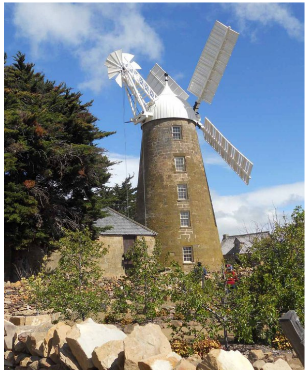
Life returns to Callington Mill, November 2010.