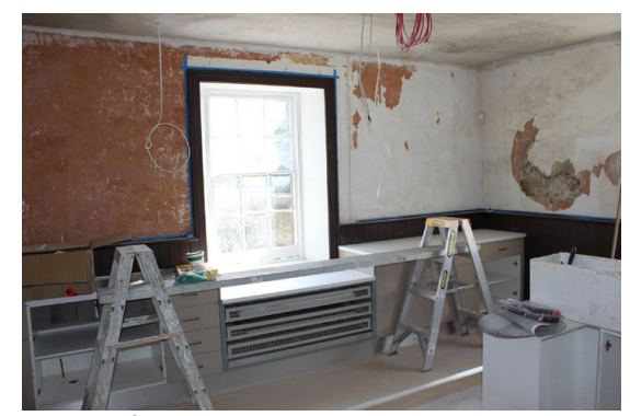
The new artifact lab in the Oatlands Gaol takes shape, January 2011.