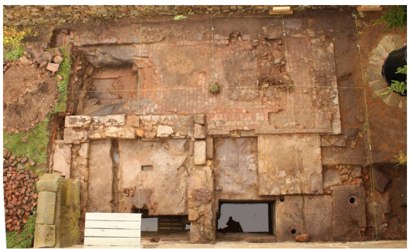
The footprint of the Callington Steam Mill, uncovered in 2011.