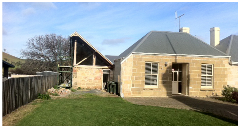
The Watch House roof, reconstructed – works in progress