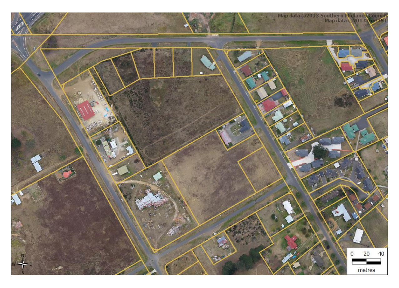
Image 1 – Aerial Photo taken in January 2011 clearly shows the lot subject to the Amendment and Development Application and the adjoining properties

No representations or comments were received in relation to the draft planning scheme amendment.