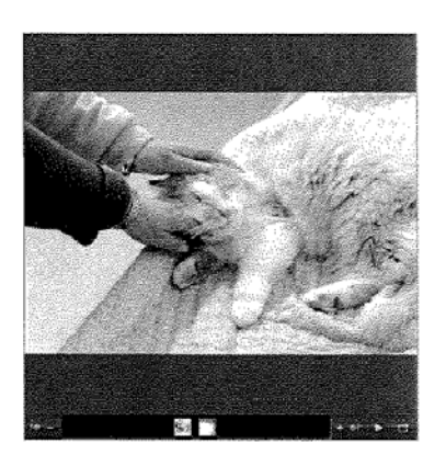
DPIW Cat Managment in Tas info