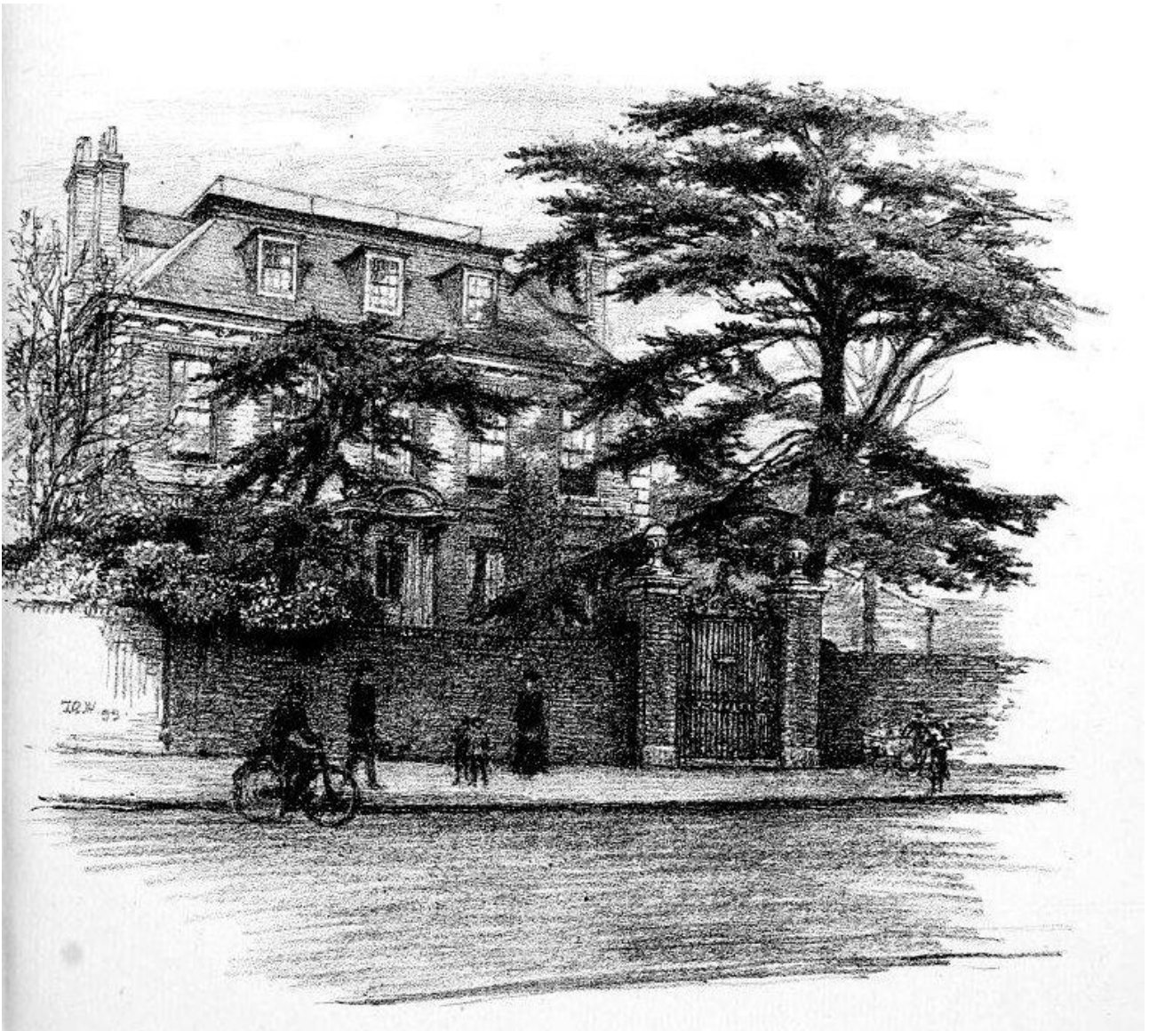
Fairfield House, Tooting, formerly Dr Lord's School