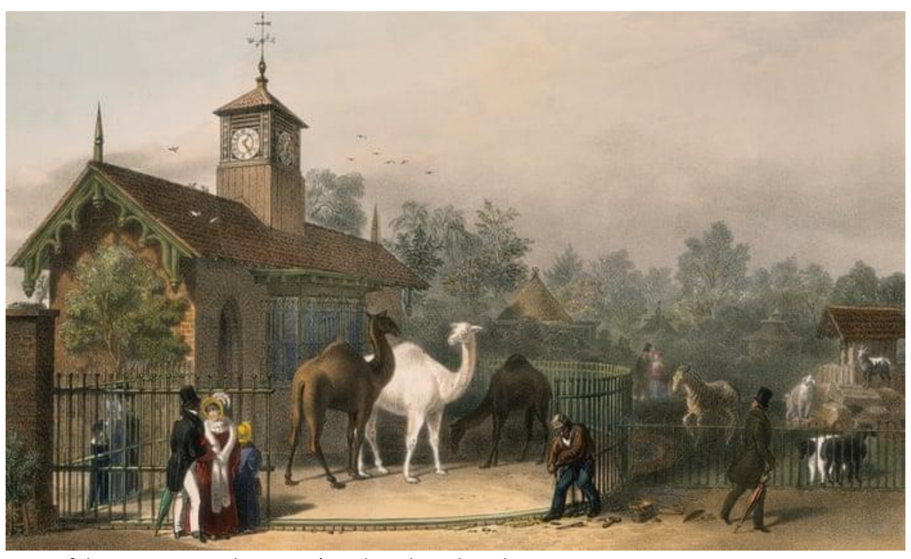
Some of the menagerie at the Regent's Park Zoological Gardens, 1835