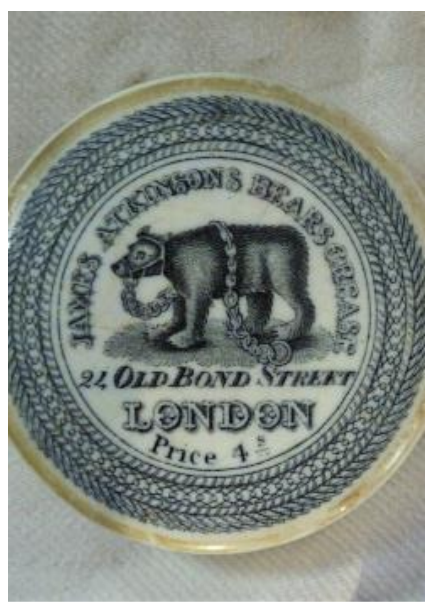
When smearing rendered bear fat on your balding scalp, use only James Atkinson's

Hard to believe now, but in 19<sup>th</sup> century England a 'pomade' of bears grease was a popular remedy for men with receding hair lines. In use as far back as the 17<sup>th</sup> century, the thinking behind bears grease as a balness cure was that bears are hairy, therefore bears' fat (grease) must promote hairiness. Perhaps not the most scientific theorem, but it sold a lot of bears grease