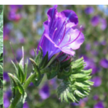
Paterson's curse Flower