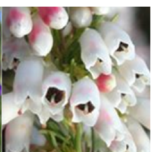
Spanish heath flowers