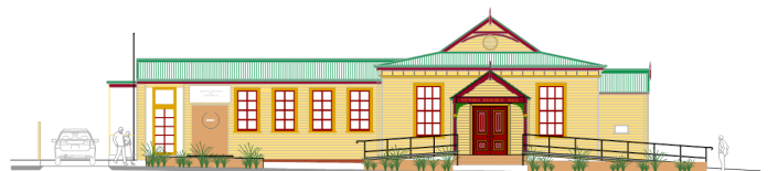
Victoria Memorial Hall Proposed Verandah Addition, Civil and Landscaping Works Concept Design

Landscaping and paving will also be undertaken to create an appealing and multi-purpose building forecourt. This project is an outcome of Council working in conjunction with the Town Streetscape Committee, which consists of representatives from the various organisations within Kempton.