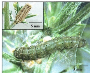
Gorse soft shoot moth – adult & larva