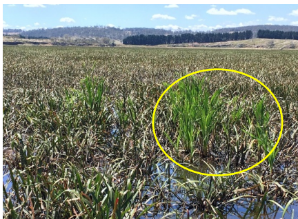
Hard to spot - Cumbungi highlight-

Cumbungi or Bullrush ( Typha latifolia ) is an introduced weed that can invade lakes, waterways and wetlands throughout Tasmania, mainland states and overseas. It prefers slow moving water up to two meters deep with high nutrient levels and lack of shade. The dense stands and rapid growth of cumbungi make it one of the most troublesome of the invasive aquatic weeds, causing restricted water flow and siltation. Decaying top growth can lead to anaerobic (no oxygen) conditions which foul the water and reduce water quality impacting the general aquatic habitat, including invertebrates and fish. Once established in an area it begins to produce rhizomes (running roots) which may extend the plant to a diameter of 3 metres in its first year!