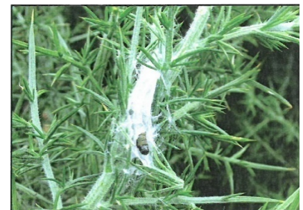
Gorse soft shoot moth larva

English broom: The broom gall mite Aceria genistae was released in 2004 and is now well established around Lake Dulverton. It has since spread to adjoining areas including along Tunnack road to Parattah township. The mite forms characteristic galls (see below photo on right) that indicate the mite is active on a plant. Unlike a lot of biocontrol agents, the broom gall mite can kill English broom. Take a closer look at the English broom next time you are on the Lake Dulverton walking track where the mites are very active.