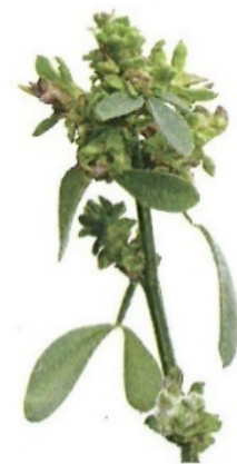
'galls' on infested stem

The future looks promising for biocontrol agents to continue to spread from existing nursery sites and reduce the impact of both English broom and gorse in the Southern Midlands. In order to speed up this process, we have collected the gorse soft shoot moth and released it at two new sites near Oatlands and Lemont in February 2018.