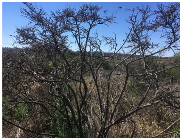
English broom killed by the broom gall mite at Lake Dulverton