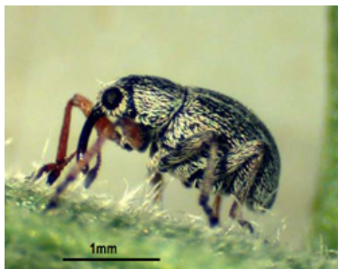
Gorse weevil adult

Gorse: There are now four agents exerting biological control on gorse in Tasmania. The gorse weevil Exapion ulicis is widespread and attacks summer seed and has been present in the state since the 1900s. The gorse spider mite Tetranychus lintearius was released in 1998 and is now widespread across the state. The gorse thrip Sericothrips staphylinus was released in 2001. The gorse soft shoot moth Agonopterix umbellana was released in 2007. It is now well established and spreading at several sites in the municipality including near Melton Mowbray and Lake Tiberias. The gorse weevil and the gorse soft shoot moth are showing considerable promise for the future by reducing the amount of seed produced and plant growth.