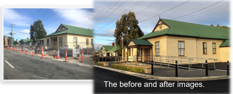
The before and after images.

It is also acknowledged that funding to bring the Memorial Arch Clock back to its former glory is also underway.