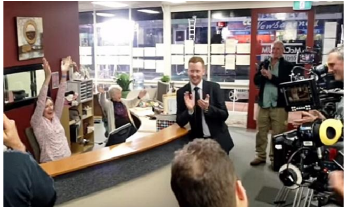
The CT Fish building on the High Street in Oatlands. will feature as the Real Estate Agent location.

Eight new episodes of ROSEHAVEN will be filmed in and around Hobart, the Huon Valley and Oatlands.