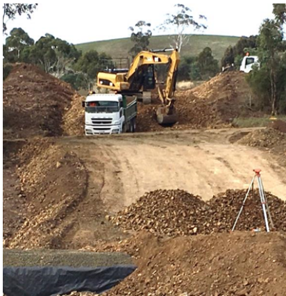
Looking East along Yarlington Road

With the aid of funding from the Australian Government through the Black Spot Road Safety Funding Program coupled with a capital works allocation from the Council budget. With the safe sight distances now implemented as part of the construction, we will have added value to the local travellers as well as visitors to our area.