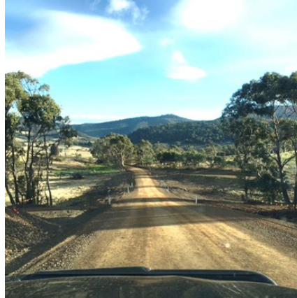
Looking West along Yarlington Road