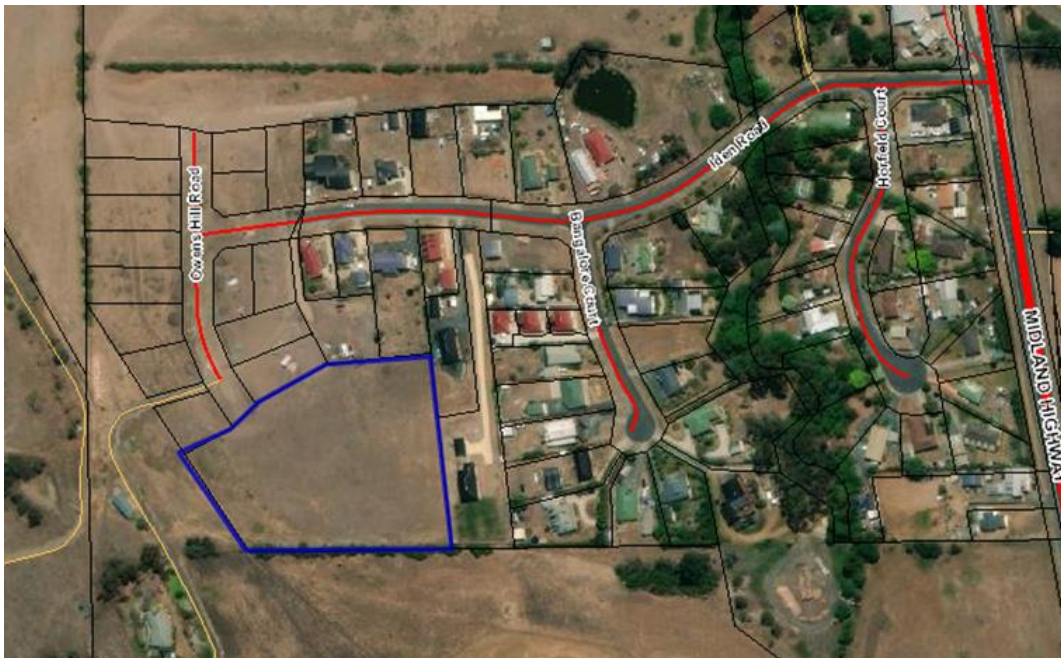
Map 2 _ Aerial image of the subject land and surrounding area, with the approximate boundaries marked in blue.