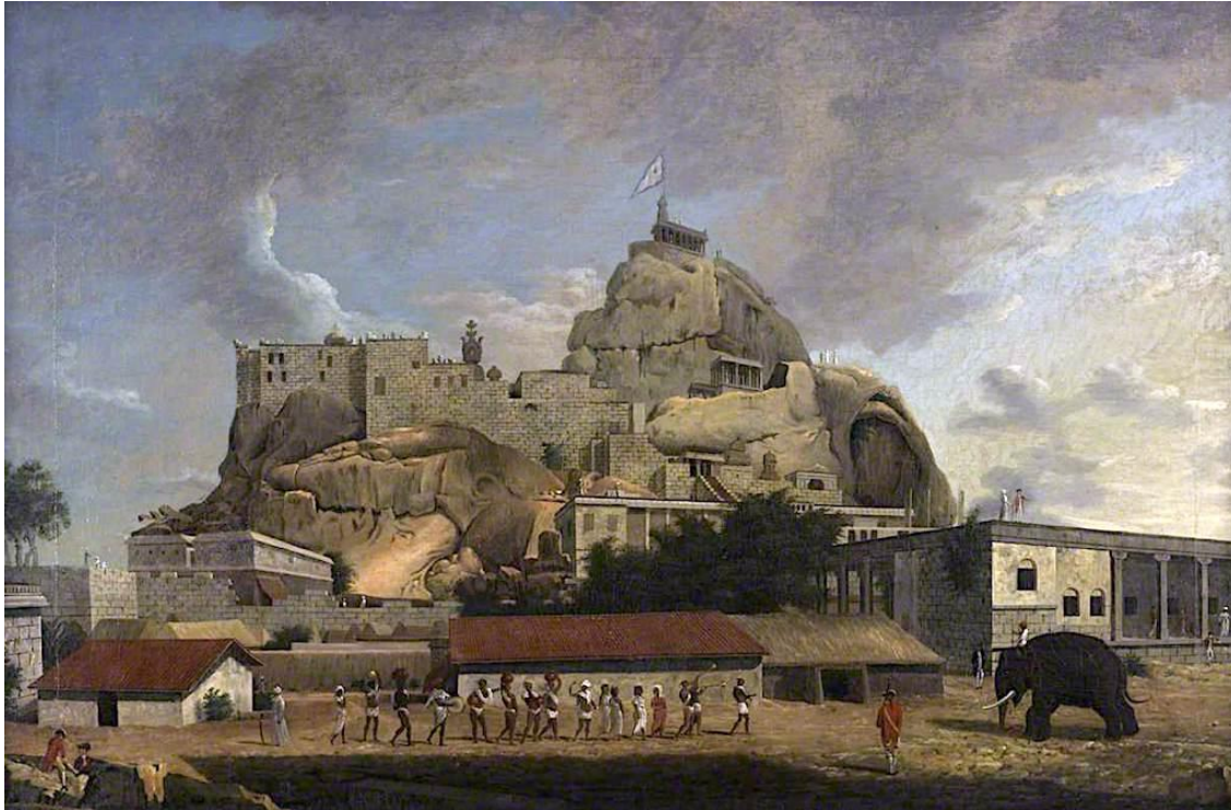
The Rock at Trichonopoly, Madras, with the Barracks – Francis Swain Ward ca 1773