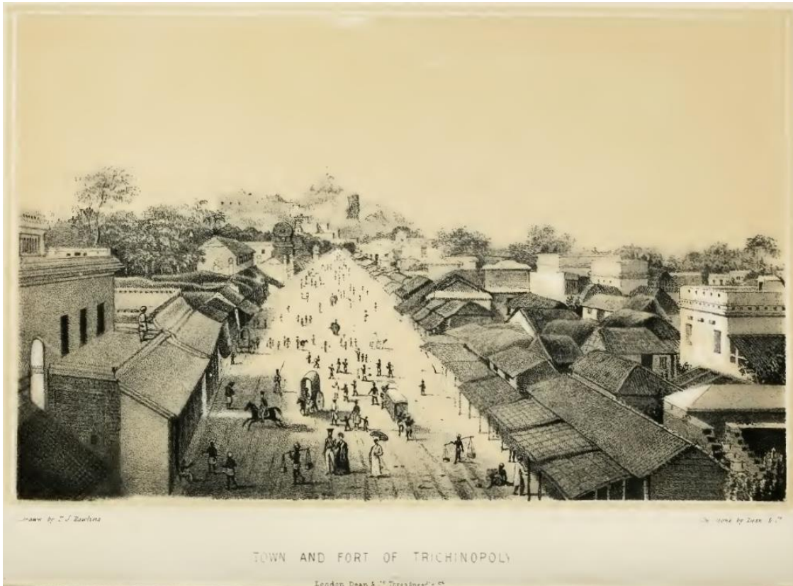
The Town and Fort of Trichonopoly (engraving, 1847)