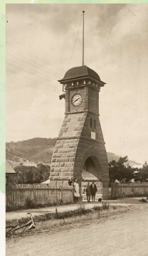
Above: Kempton World War I clock tower and memorial, erected in honour of those who served, unveiled on 9 November 1922