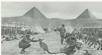
Left: Lines of the Australian 9th and 10th Battalions at Mena Camp