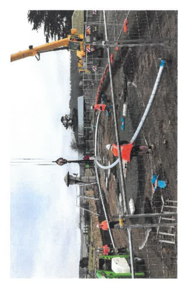
Crane on site 7 August 2020 for installing the 'big' pieces of equipment

Photo taken 14 September 2020 – getting closer to completion. Fina<mark>l sparasses include coating the soft fall rubber, spreading pine bark, finishing the flying fox and installing the last 'spinner'</mark>