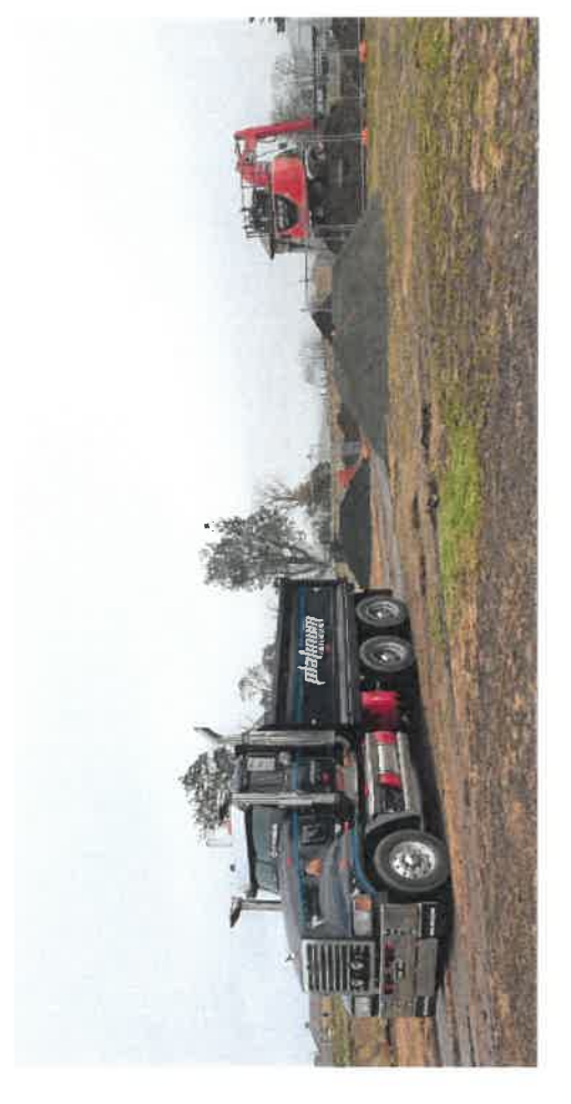
Top soil was removed from the site to create a 'base surface' to work on