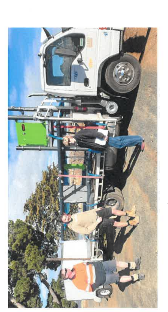
Workers and first load of play equipment arrive on site 13 July 2020