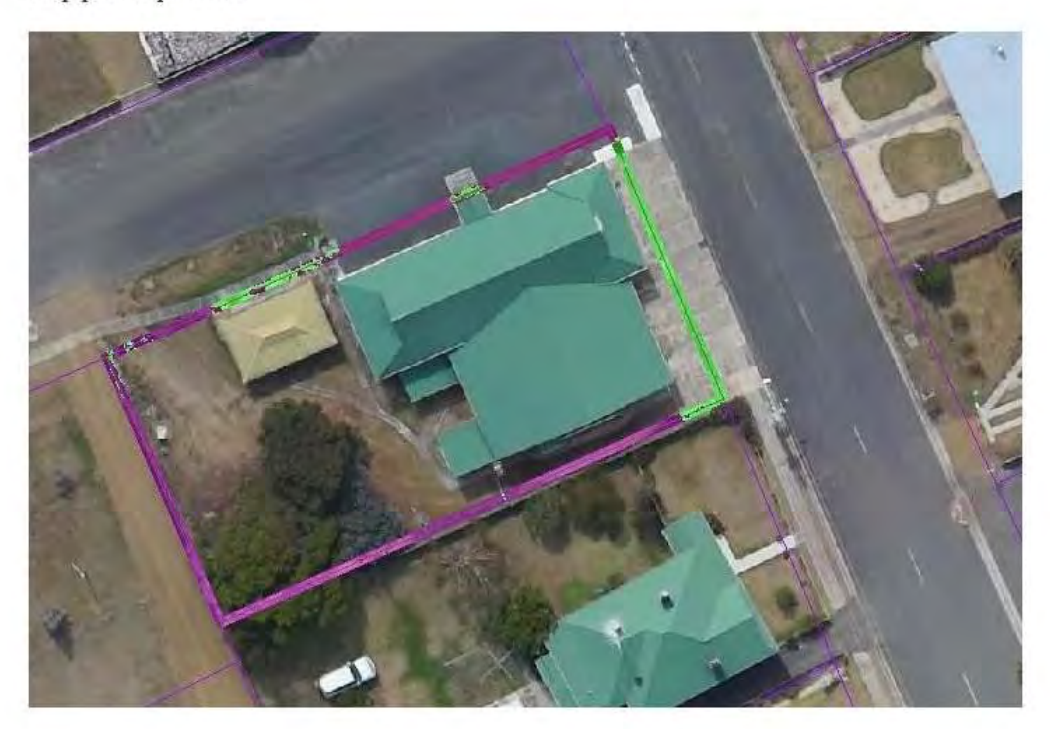
ANNEXURE A Map/plan of premises