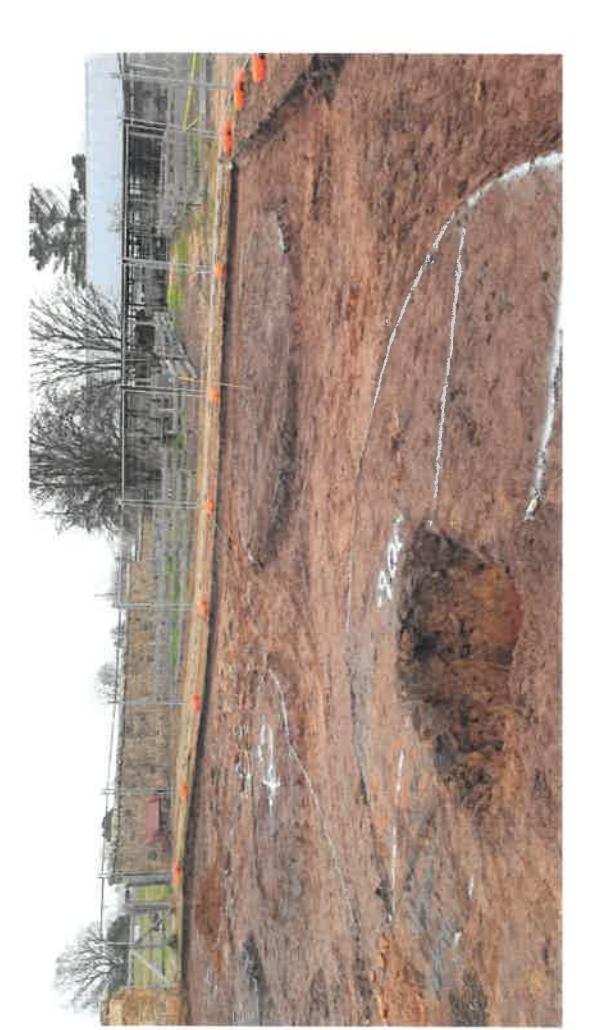
Measure and measure again