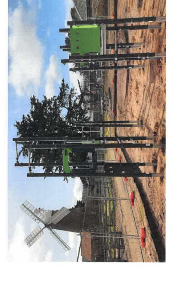
First piece of equipment in place