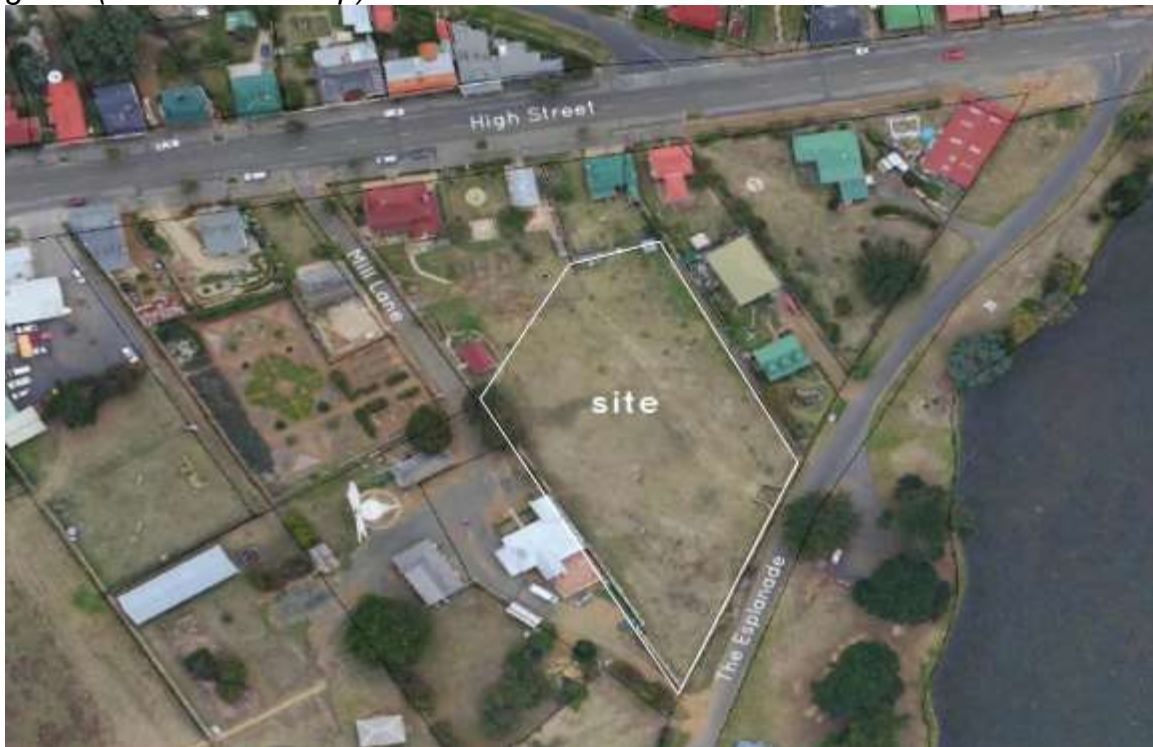
Map 2 _ Aerial image of the subject land and surrounding area. The development site is marked with a star (Source: LISTmap).

Environmental Management (green). The site and surrounding features are labelled in green (Source: LISTmap).