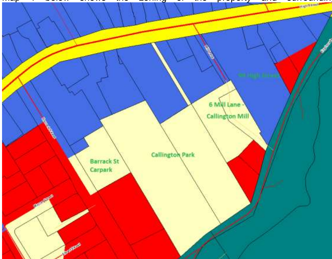
Map 1_ The subject land is located in the General Business Zone (blue) Nearby properties zoned General Residential (red) adjoining the site and Lake Dulverton is zoned

Map 1 below shows the zoning of the property and surrounding land.